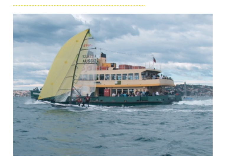
Note from editors to UK contingent: Big green boats with red diamonds on top have rights. Ask James and Angus.